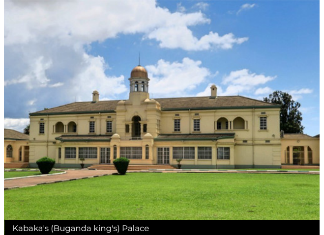
Kabaka's (Buganda king's) Palace