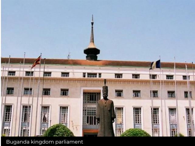
Buganda kingdom parliament